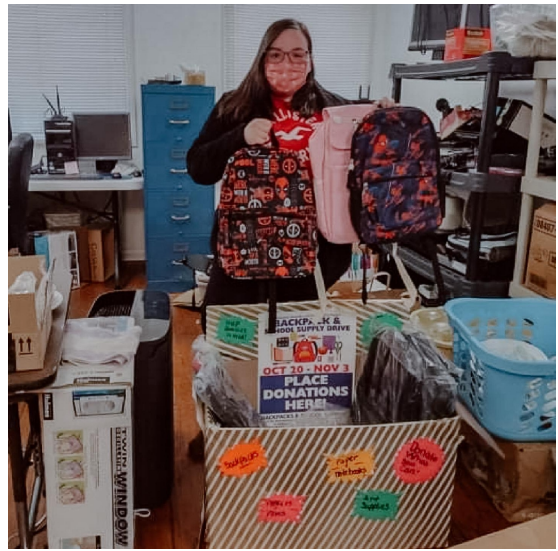
The Holocaust, Genocide and Human Rights Project at Monroe Community College collected over 200 school supply items for the Afghan children.

The Owego, NY area youth of Church of Jesus Christ of Latter Day Saints, and the Rochester Christian School donated hand- tied fleece blankets as gifts for the Afghan children in our program.