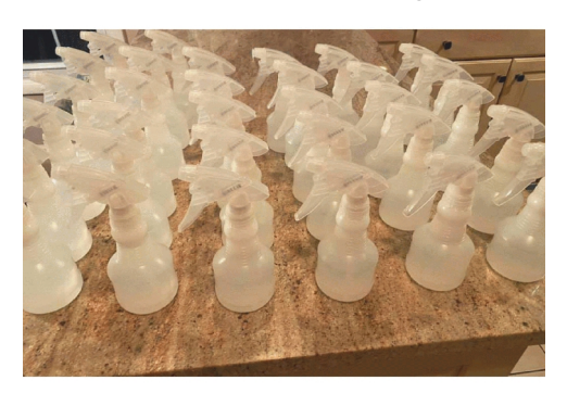
Devon Holland donated 120 spray bottles, and Terry Schwartz filled each one with diluted bleach solution to give to each family for home disinfecting.