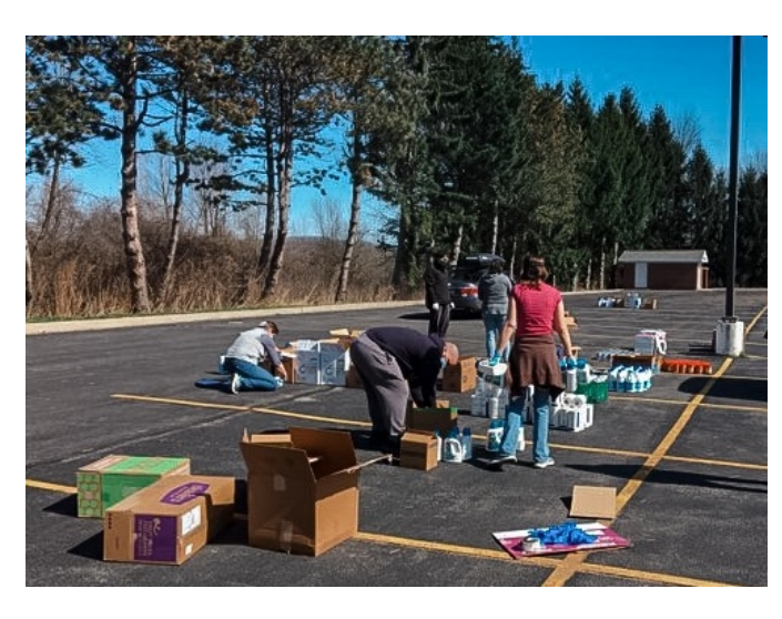
Families needed supplies available through our LDS grant. Volunteers coordinated pickups where hygiene items could be placed into the trunks of SIV or volunteer's cars.