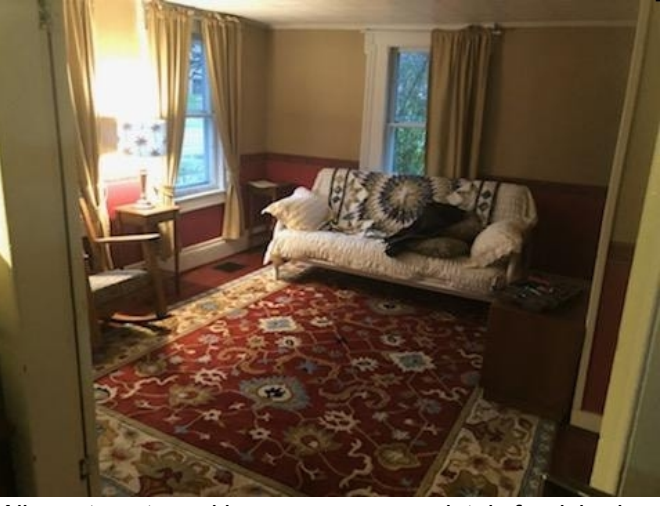
All apartments and houses were completely furnished by community donations and a grant from LDS.