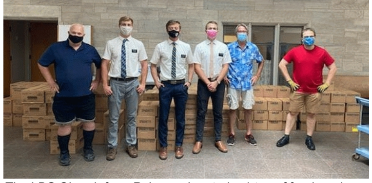
The LDS Church from Palmyra donated a 1 ton of food, and Asbury First United Methodist Church stored it for KOP.

Donations from the Latter Day Saints, Hearts & Homes for Refugees, Interfaith Council of New Americans, individual donors, and a grant from the United Way helped with food gift cards, rent support, phone bills, electric bills, one-time car insurance payments that were due (necessary so a family would not lose their car).