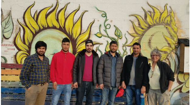
Some of the many SIVs who helped organize the space at Greenovation!