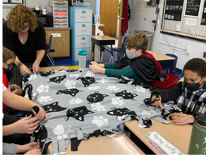
The Owego, NY area youth of Church of Jesus Christ of Latter Day Saints, and the Rochester Christian School donated hand- tied fleece blankets as gifts for the Afghan children in our program.