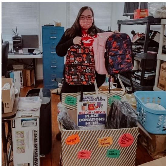
The Holocaust, Genocide and Human Rights Project at Monroe Community College collected over 200 school supply items for the Afghan children.