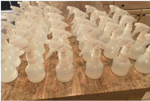
Devon Holland donated 120 spray bottles, and Terry Schwartz filled each one with diluted bleach solution to give to each family for home disinfecting.