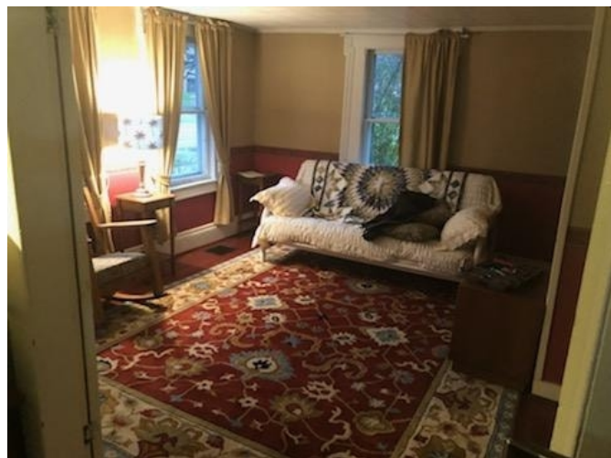
All apartments and houses were completely furnished by community donations and a grant from LDS.