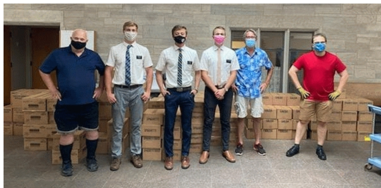
The LDS Church from Palmyra donated a 1 ton of food, and Asbury First United Methodist Church stored it for KOP.

Donations from the Latter Day Saints, Hearts & Homes for Refugees, Interfaith Council of New Americans, individual donors, and a grant from the United Way helped with food gift cards, rent support, phone bills, electric bills, one-time car insurance payments that were due (necessary so a family would not lose their car).