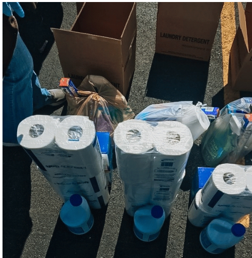
Families needed supplies available through our LDS grant. Volunteers coordinated pickups where hygiene items could be placed into the trunks of SIV or volunteer's cars.