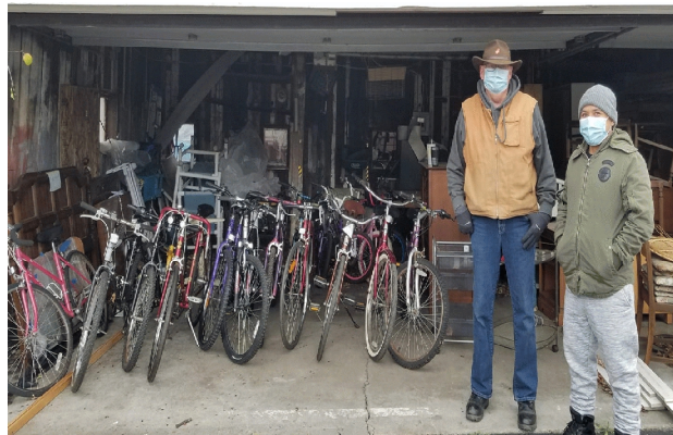
R-Community Bikes continues to offer bicycles to each SIV family, but we now get bikes in bulk to limit in-person exposure.